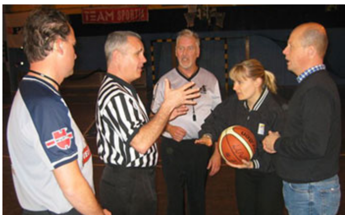
Deaf referees are instructed by international FIBA referee.